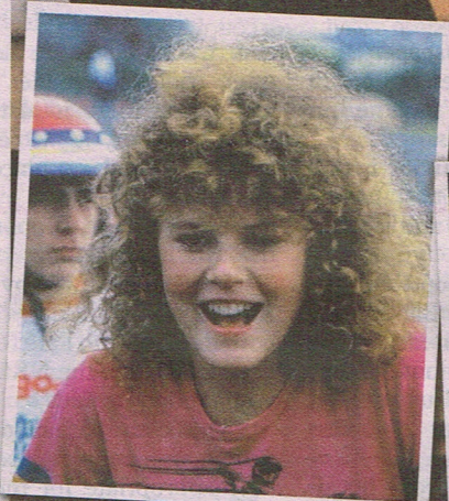
Nicole Kidman poses for marie claire Australia magazine, in her first shoot for the publication.